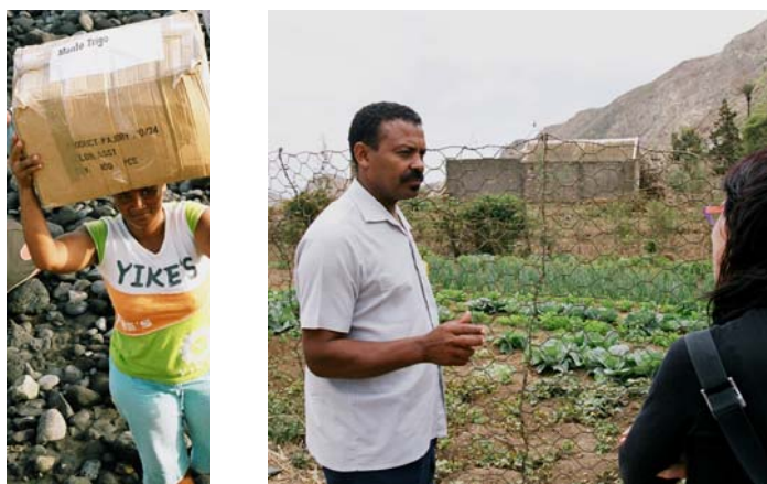
Delivery to Monté Trigo // School vegetable garden in Belem.

Regarde ailleurs continues to concentrate its charitable actions on the rural islands of São Nicolau and Santo Antão. The association extended the geographical perimeters of its school aid from 9 schools in 2007 to support 12 schools in 2008. Out of the 12 schools, 8 received food aid while the other 7 received school materials. The members of the association also mediated an agreement between a local landowner and a school. This agreement resulted in the school obtaining a plot of land to start a vegetable garden in an area where arable land is scarce. The first crop of vegetables is currently being produced.