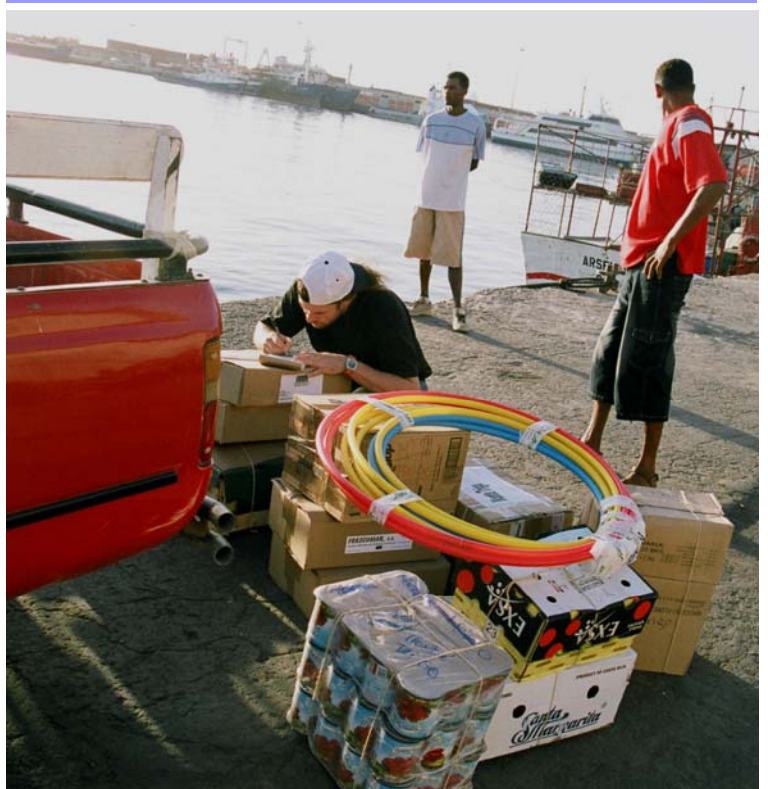
Signing the shipping receipts in Mindelo

This means that from now on the association will receive delivery notes and receipts for all aid distributed in the area.