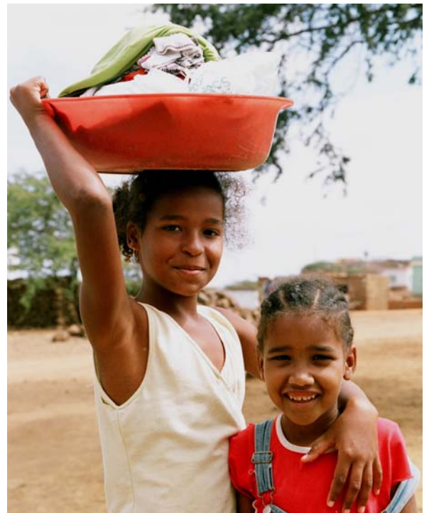
Young girls from Juncalinho // Island of São Nicolau

Regarde ailleurs is a Registered Charity