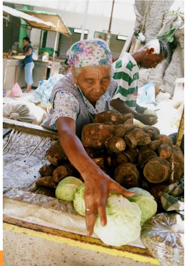
Buying food at the Ribeira Grande Market

It is also important for the association to be even more attentive to the aid projects drawn up by the Cape Verdean Department of Education.