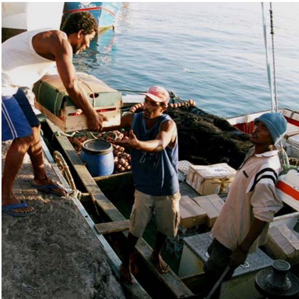
Loading the boat in Mindelo for Monté Trigo